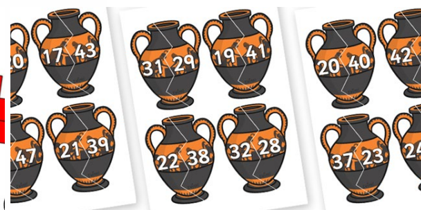
Number Bonds to 100 on Ancient Vases