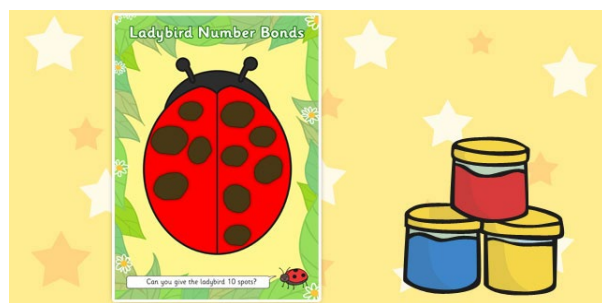
Ladybird Play Dough Mat